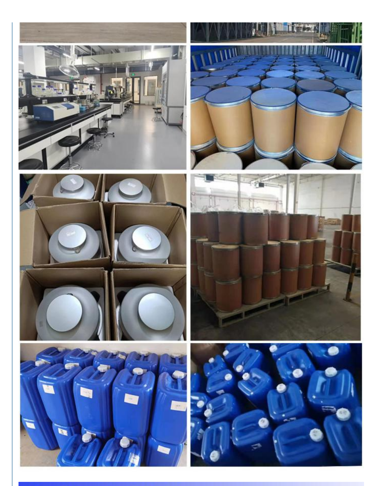
Packing And Delivery