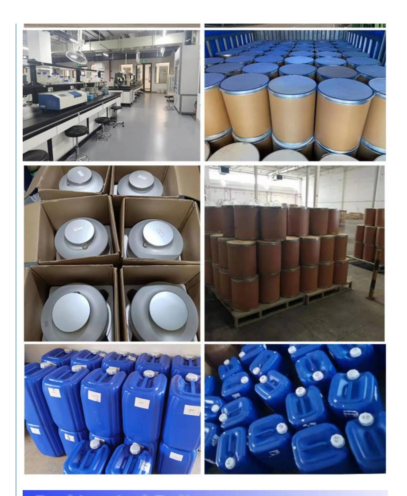
Packing And Delivery