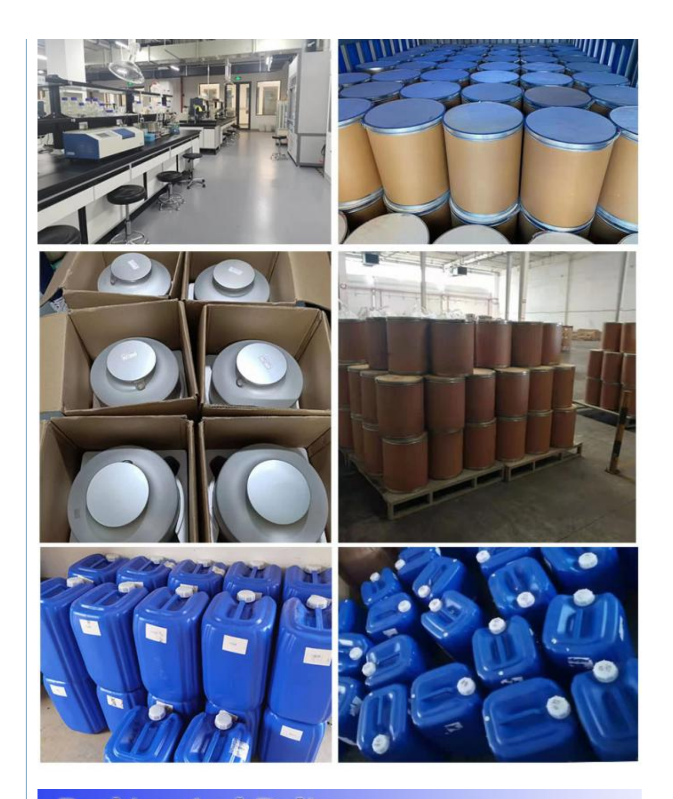
Packing And Delivery