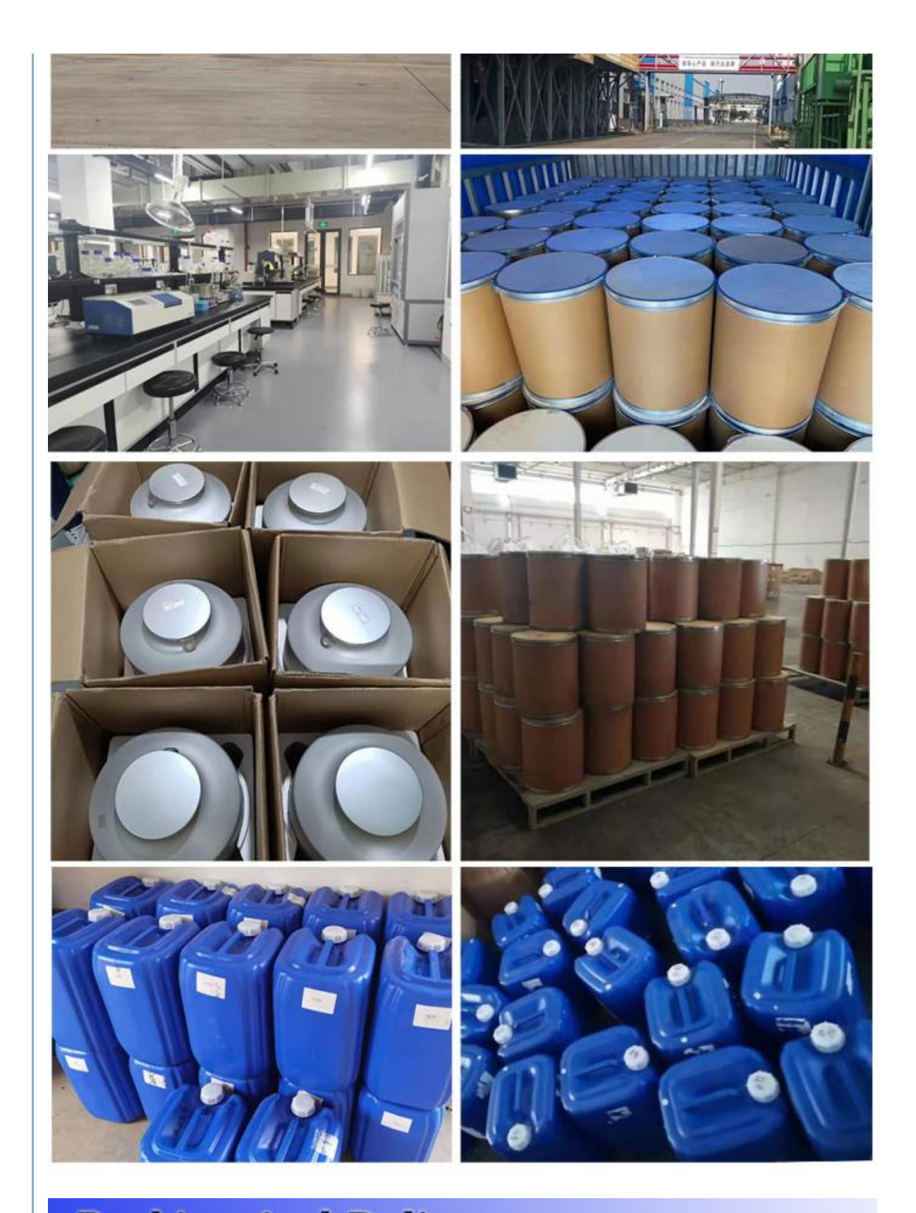
Packing And Delivery